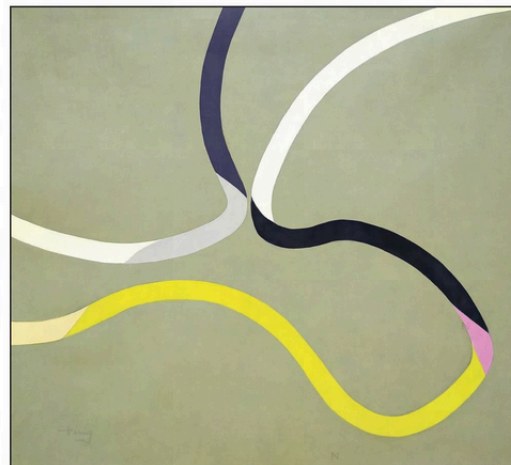
'Divertimento 4,' acrylic on canvas by Mimi Chen Ting

For more information, contact Hulse/Warman Gallery at (575) 751-7702. Visit www.hulsewarmangallery.com .