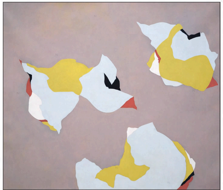
'Refractions,' by Mimi Chen Ting